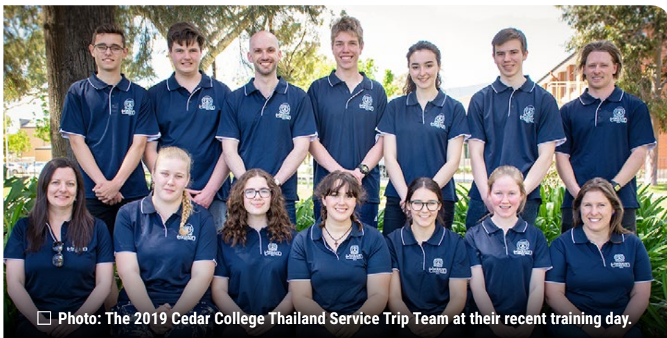
Photo: The 2019 Cedar College Thailand Service Trip Team at their recent training day.